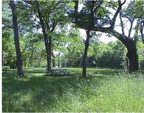
Fox Bottom Primitive Campground